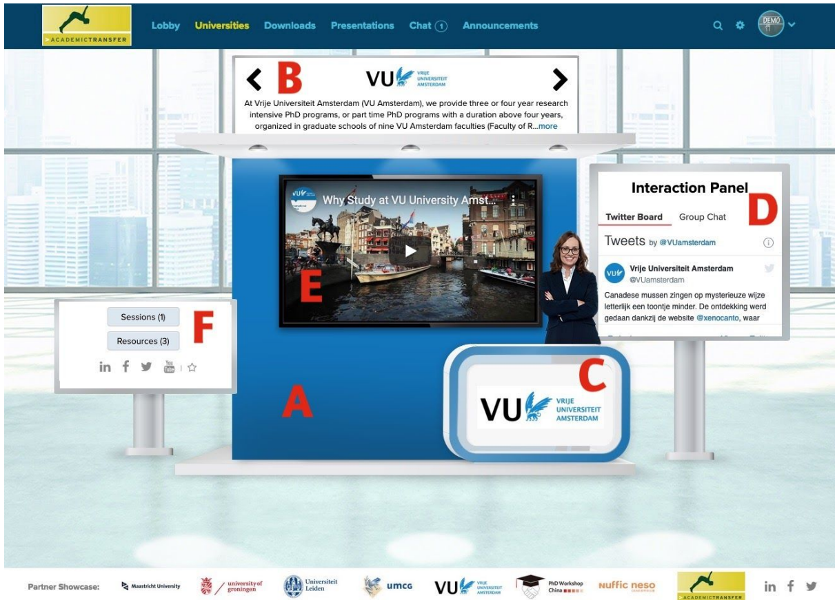
An example booth

The information board can have different entry types. Most important are the links to your sessions. Please see for in depth explanation in the next chapter. You can also provide resources, documents that can be downloaded or accessed by the visitors without having the need to interact with your staff. Consider to provide brochures (.pdf), flyers (.pdf), website links (https://), pictures (.jpg) and video material (.mp4). You can also link at the bottom of the panel to your Social Media sources, but please be aware of the visibility limits due to the Chinese firewall.