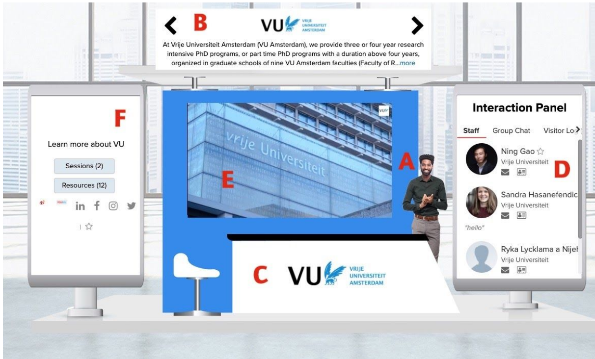
An example booth

The information board can have different entry types. Most important are the links to your sessions. Please see for in depth explanation in the next chapter. You can also provide resources, documents that can be downloaded or accessed by the visitors without having the need to interact with your staff. Consider to provide brochures (.pdf), flyers (.pdf), website links (https://), pictures (.jpg) and video material (.mp4). You can also link at the bottom of the panel to your Social Media sources, but please be aware of the visibility limits due to the Chinese firewall.